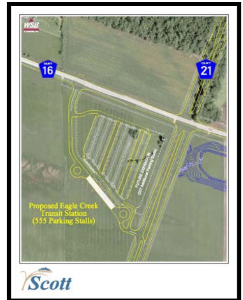
Coming Soon Future Eagle Creek Transit Station

Scott County and the Cities of Prior Lake, Shakopee and Savage partnered to conduct a study to evaluate ridership of the potential Dan Patch light rail line. The final results of this study will be presented in the near future.