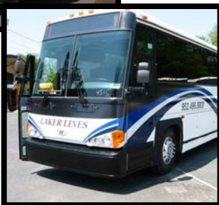
BlueXpress Buses Operated Jointly by the City of Prior Lake and the City of Shakopee